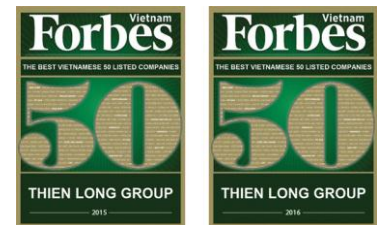
Thien Long Group has been a Forbes Vietnam Top 50 company since 2013