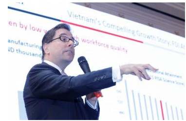
Chief Economist Michael Kokalari

illustrated how Vietnam has gone from an underperformer to an outperformer in just four years. Touching on the frequent comparison between Vietnam and China, Mike noted some of the similarities but also the significant differences, such as China's ability to better mobilize resources and its quicker pace of SOE and other economic reforms, and Vietnam's faster rate of FDI. While banking sector reform bears watching, Mike is confident that the macroeconomic landscape over next year should support continued market growth.